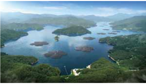
An image of the planned 41MW project that Q CELLS is developing at the Hapcheon Dam in South Korea.

scale floating solar in coal areas could be copied in other markets. "Although the national conditions of each country are not the same, each country will have some abandoned waters with very low utilisation value," he says. "We believe that governments of all countries can learn from China's experience and focus on planning these abandoned waters with low utilisation value as floating PV power plants, so as to develop clean energy while making full use of water resources, saving land, driving economic development and employment. This is a choice that every smart and responsible government will make."