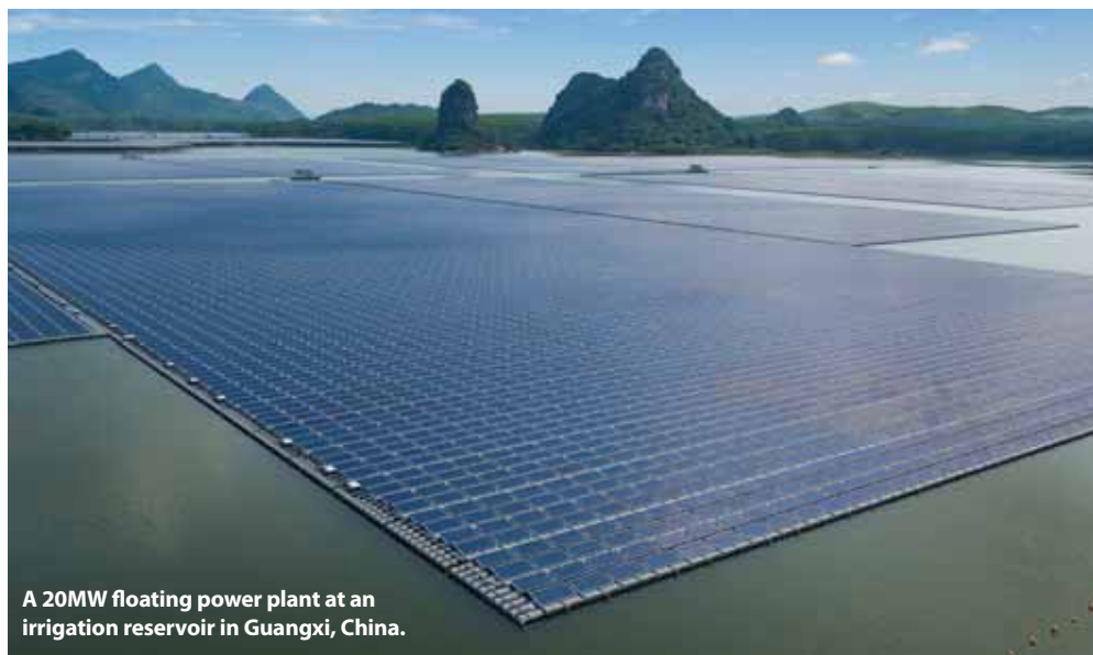
A 20MW floating power plant at an irrigation reservoir in Guangxi, China.

"Additionally, Asia is a fairly dynamic region with some countries experiencing high single or even double-digit annual electricity growth rates. Given that these countries have inland water bodies that are often in the vicinity of load centres, the need for long distance power transmission and associated curtailment issues are eliminated. Because of this on-site consumption, floating PV made a